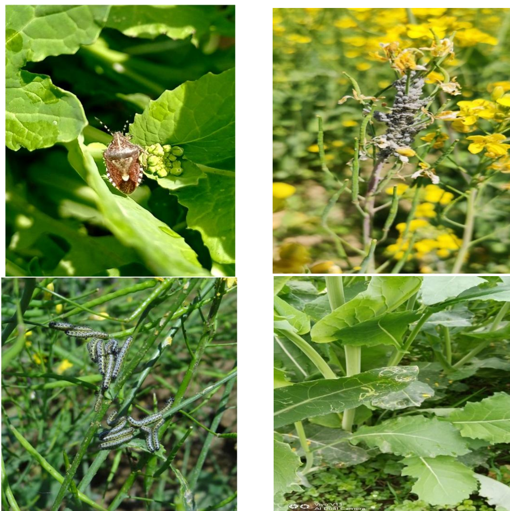
Fig. 2. Some insect pests of rape seed mustard In Kashmir Valley. 1, Shield bug, 2, Lipaphis erysimi 3, Pieris brassicae 4, Phytomyza horticola